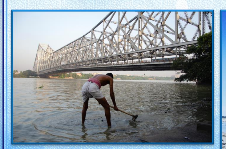
HOWRAH BRIDGE